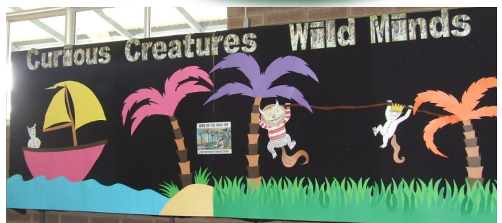
Book Week theme this year 'Curious Creatures Wild Minds'