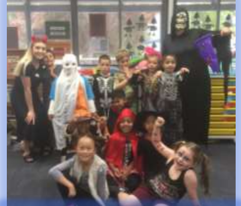
Halloween time for the members of Room 4.