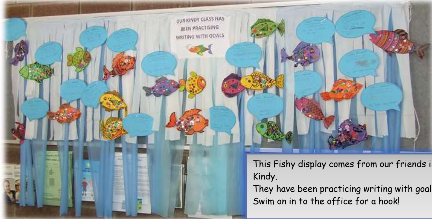
This Fishy display comes from our friends in Kindy. They have been practicing writing with goals. Swim on in to the office for a hook!